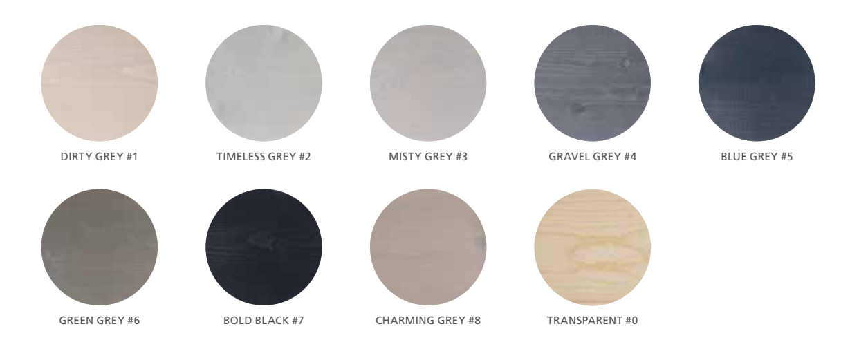
The Grey Collection

The colours shown are for reference only and are not binding.