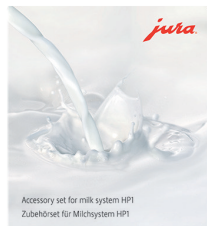
Accessory set for milk system HPI Zubehörsatz für Milchsystem HPI