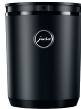
Cool Control 1.01 Black (UKB), Art. 24280