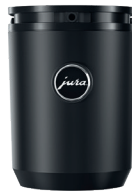
Cool Control 0.61 New Black (UKB), Art. 24284 White (UKB), Art. 24282