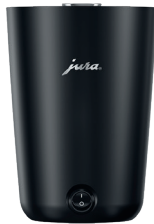
Cup warmer S Black, Art. 24176 White, Art. 24175