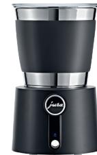
Automatic Hot & Cold Milk Frother Art. 24018